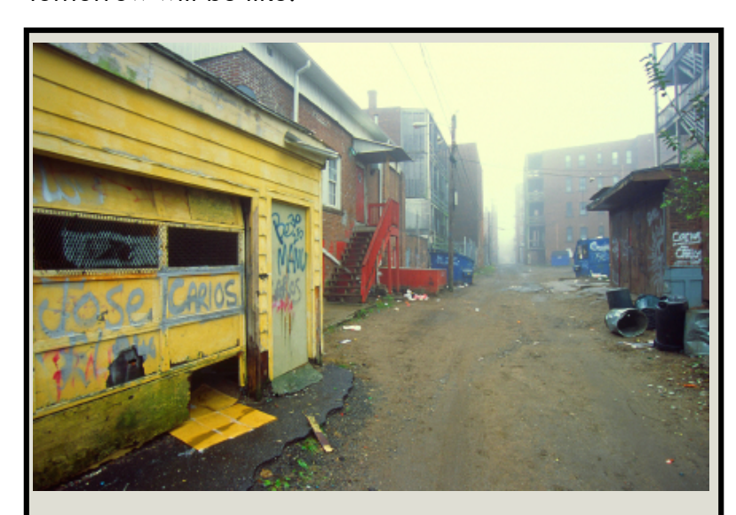
Slum in Holyoke Massachusetts

Your Bible shows a literal UTOPIA is ahead! It will be a time of spiritual and physical rejuvenation—one thousand years of boundless peace and prosperity! And with the help of this lesson, God has made it possible for you to peer into the future through His prophecies so you can know what that wonderful world tomorrow will be like!